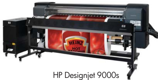
HP Designjet 9000s

Add this high-speed dryer to your HP Designjet 9000s printer and accelerate drying time for improved printer productivity.