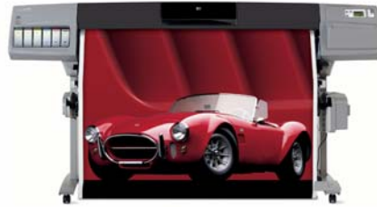
HP Designjet 5500

Sign shops, print shops and screen or commercial printers expanding into outdoor signage; customers choosing this series will need high speeds and high productivity via a cost efficient solution.