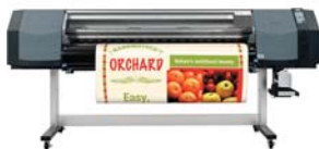
HP Designjet 8000s