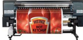
HP Designjet 9000s