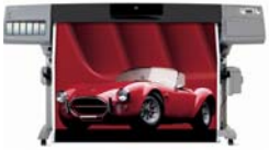
HP Designjet 5500