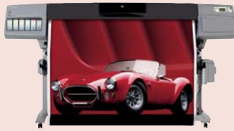
HP Designjet 5500