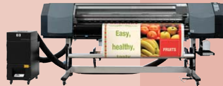
HP Designjet 8000s