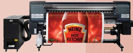
HP Designjet 9000s